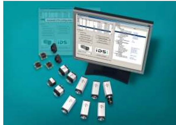
Whether it's USB or GigE – all uEye camera models from IDS use the same software driver kit, which ensures easy integration.

The camera plays a key part in this solution. The requirements specification stipulated a high resolution, a very compact design, easy connectivity and flexible integration. Winter opted for the uEye cameras from the German machine vision specialist IDS and chose the uEye UI-1480-C model, which features 2560 x 1920 pixels resolution, CMOS sensor, rolling shutter and USB interface.